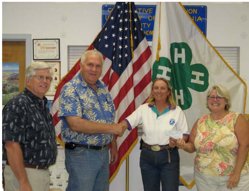
Photo Presentation of Check from No Name Car Club to the 4-H Program.

The Lake County 4-H Council would like to thank the Lake County Amateur Radio Society for their donation to the 4-H Program. It is your generosity and support which makes the 4-H Program able to continue helping the youth of our community reach their fullest potential.