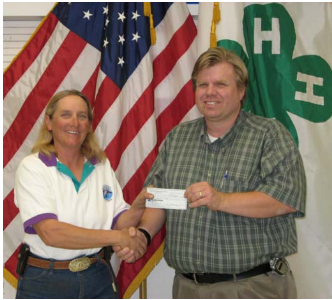
Photo Presentation of Check from HAM Radio to the 4-H Program.